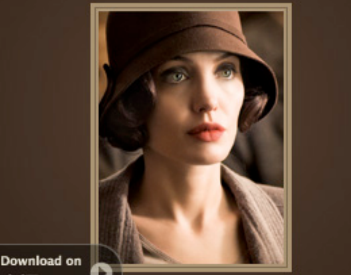
🗯 iTunes 🎙